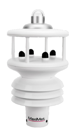
MaxiMet GMX551 measures 7 parameters including precipitation and solar radiation.