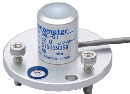
rpr-IoT-ML01 EKO ML-01 Class C Si-Pyranometer

The manufacturer reserves the right to amend the specification and therefore the information in this document may be subject to change.